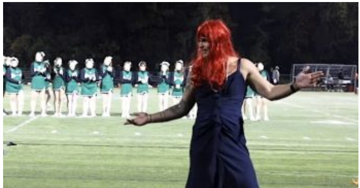
Football team holds 'drag ball' show to let 'boys express effeminate side'