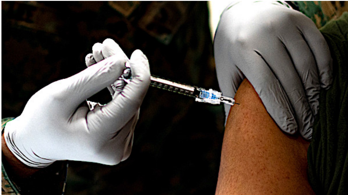
A U.S. Navy corpsman administers a U.S. Marine with the Pfizer-BioNTech COVID-19 vaccine on Camp Lejeune, North Carolina, Jan. 15, 2021.

Pfizer, the first vaccine maker to receive FDA approval for a COVID shot, has used its power to "shift risk and maximize profits," according to a consumer advocacy group that obtained secret government contracts.