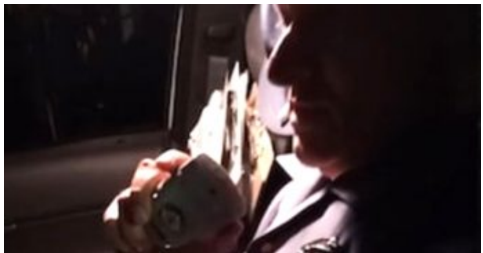
Unvaxxed state trooper signs off for last time: Governor 'can kiss my ***'