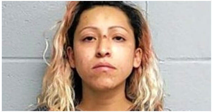
Mom of 3 charged with murder for 'shooting man for refusing to kiss her'