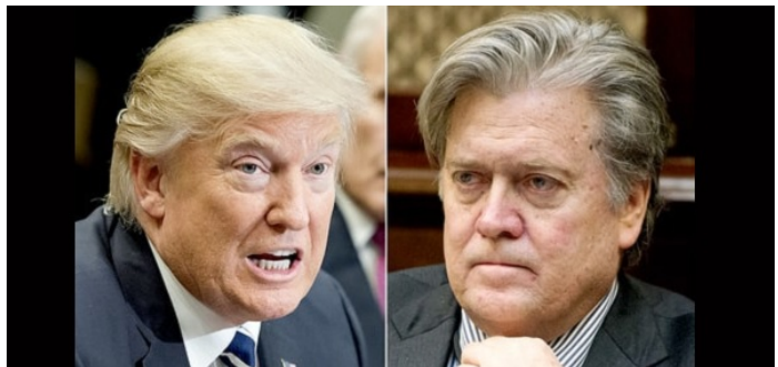
Jan. 6 witch hunt hits Steve Bannon, but ultimate target is Trump